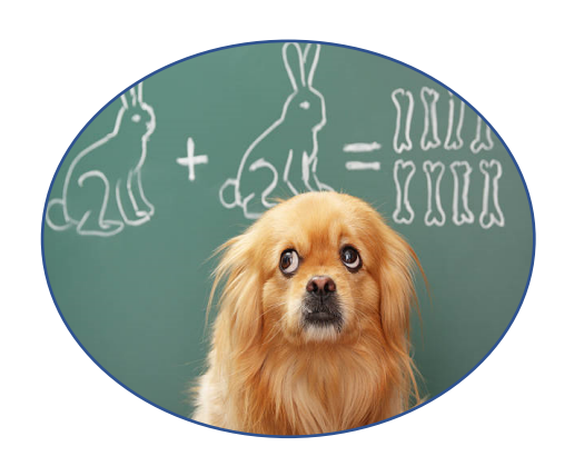
Below 5 points – Uh, oh...

Remember, this test is just for fun! Older, unwell and very young pups may not score as highly because they lack experience or motivation. OR your treats may not be good enough!