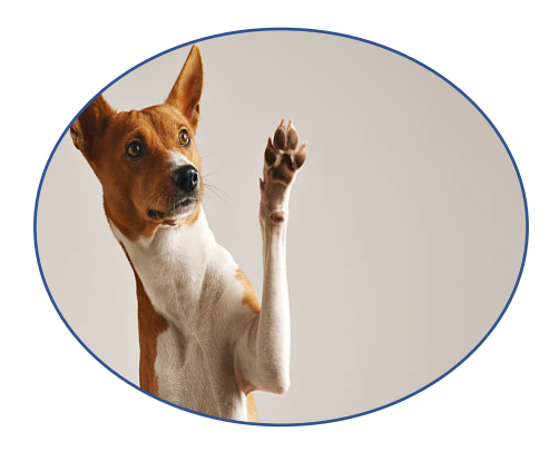
15-25 points – Your dog is smart but won't go to Cambridge